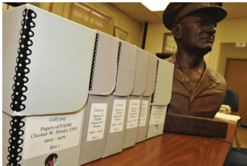
Boxes filled with the “Grey Book” World War II notebooks of Fleet Adm. Chester W. Nimitz. This 4,000 page document fills 28 of these boxes at NHHC’s Operational Archives and are representative of the richness and scope of the holdings. Recently, the Naval War College made digital copies available to the public online thanks to the support from the Naval War College Foundation.